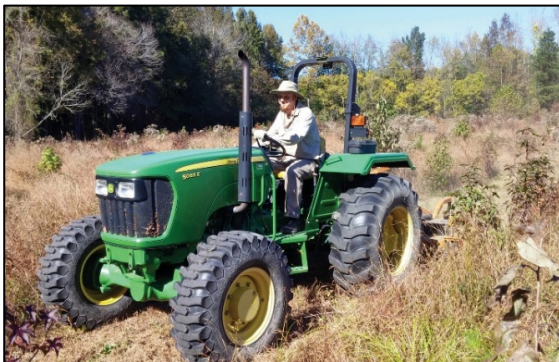
Figure 2a: Late season mowing

Prescribed burning (Figure 2b), where feasible and allowed by the landowner or local regulations, is an ideal management tool for long-term management of large-scale native pollinator plantings. Burning not only controls woody vegetation and removes any accumulated plant material, but it also enhances native perennial re-growth and often stimulates flowering and seed set. If burning is used as a management tool, the same guidelines regarding frequency and timing should be followed as those listed above for mowing. Do not burn the entire site in any given year. In order to only burn a portion of the site in any given year, a permanent fire break may need to be installed within the planting area. For more information about the use and benefits of prescribed fire, as well as laws and regulations regarding prescribed burning in North Carolina, please visit the NC Prescribed Fire Council website http://www.ncprescribedfirecouncil.org/resources.html . Additionally, the NC Forest Service maintains a list of private contractors across the state with experience in prescribed burning ( https://www.ncforestservation.gov/Managing_your_forest/contract_services.htm ).