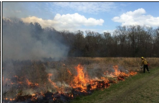
Figure 2b: Prescribed burn